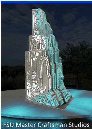
FSU Master Craftsman Studios